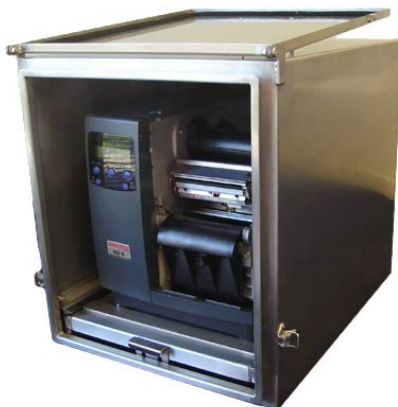
R.A.C.E. Printer Cabinet